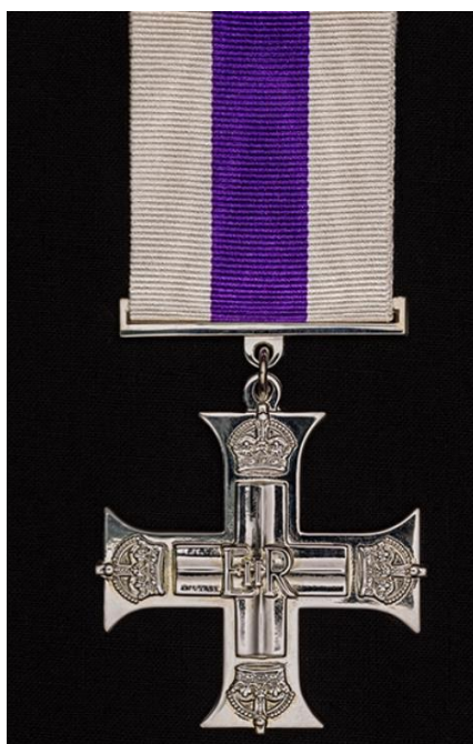
Military Cross (M.C.)

The MC is granted in recognition of "an act or acts of exemplary gallantry during active operations against the enemy on land" to all members of the British Armed Forces of any rank. In 1979, the Queen approved a proposal that a number of awards, including the Military Cross, could be recommended posthumously.