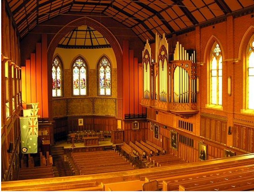
Memorial Hall at Scotch College, Melbourne